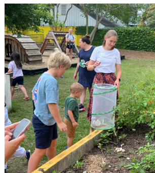
Children's Museum of Wilmington