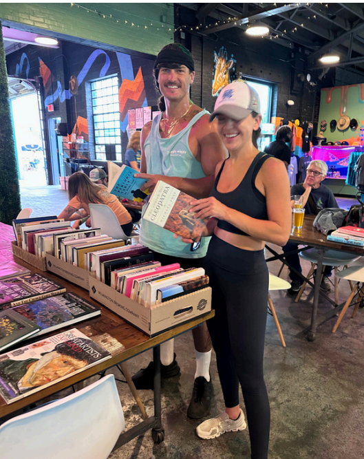
Cape Fear Literacy Council

This mixed-methods approach enabled The Endowment to both quantify results and learn from community experience, guiding future investment and strategy refinement.