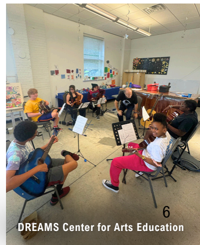
DREAMS Center for Arts Education