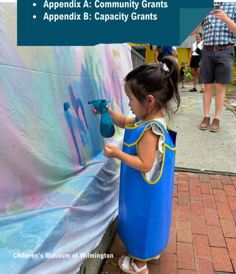
Children's Museum of Wilmington