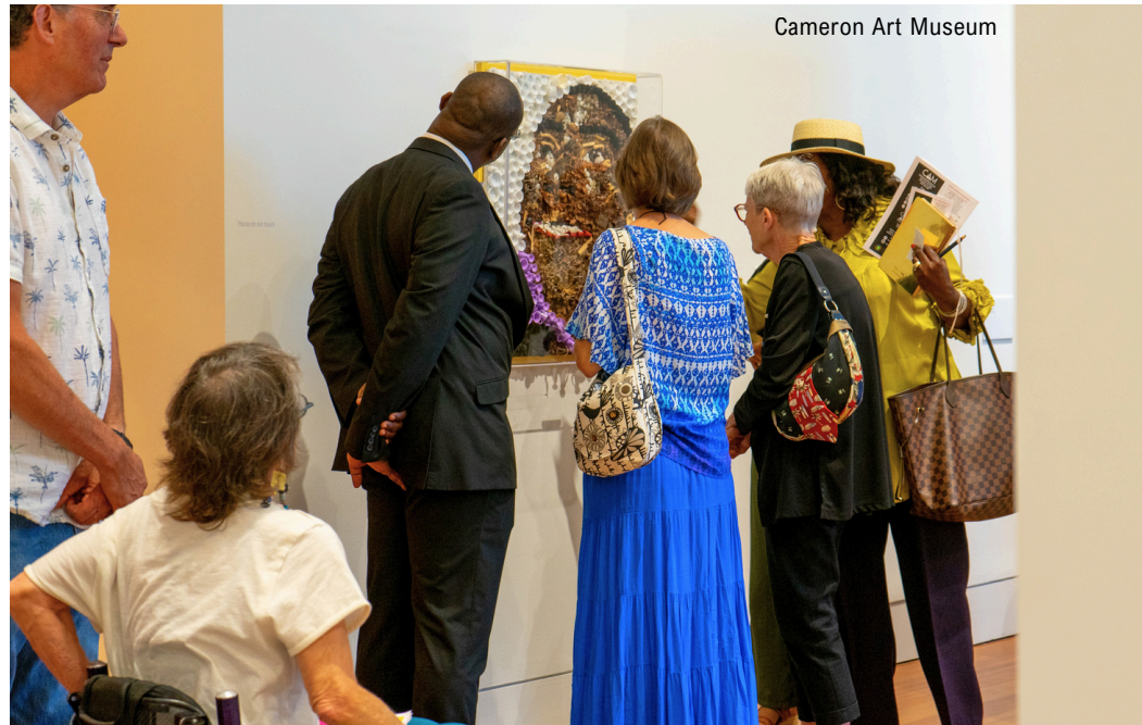
Cameron Art Museum