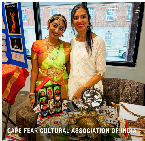
CAPE FEAR CULTURAL ASSOCIATION OF INDIA