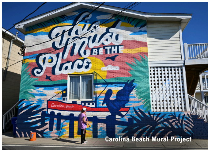
Carolina Beach Mural Project