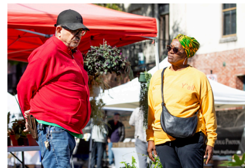
The Wilmington Farmer's Market