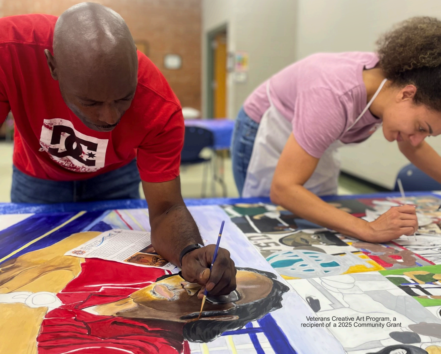
Veterans Creative Art Program, a recipient of a 2025 Community Grant