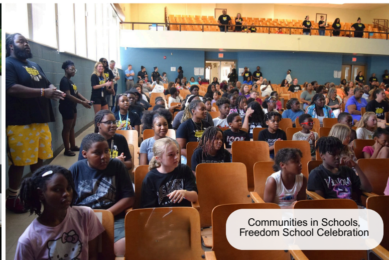
Communities in Schools, Freedom School Celebration