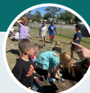
Pine Valley Garden Club

To support the Food Access Project, designed to increase access to healthy, nutritious food for households experiencing food insecurity and/or residing in a food desert.