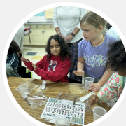
New Hanover County Schools