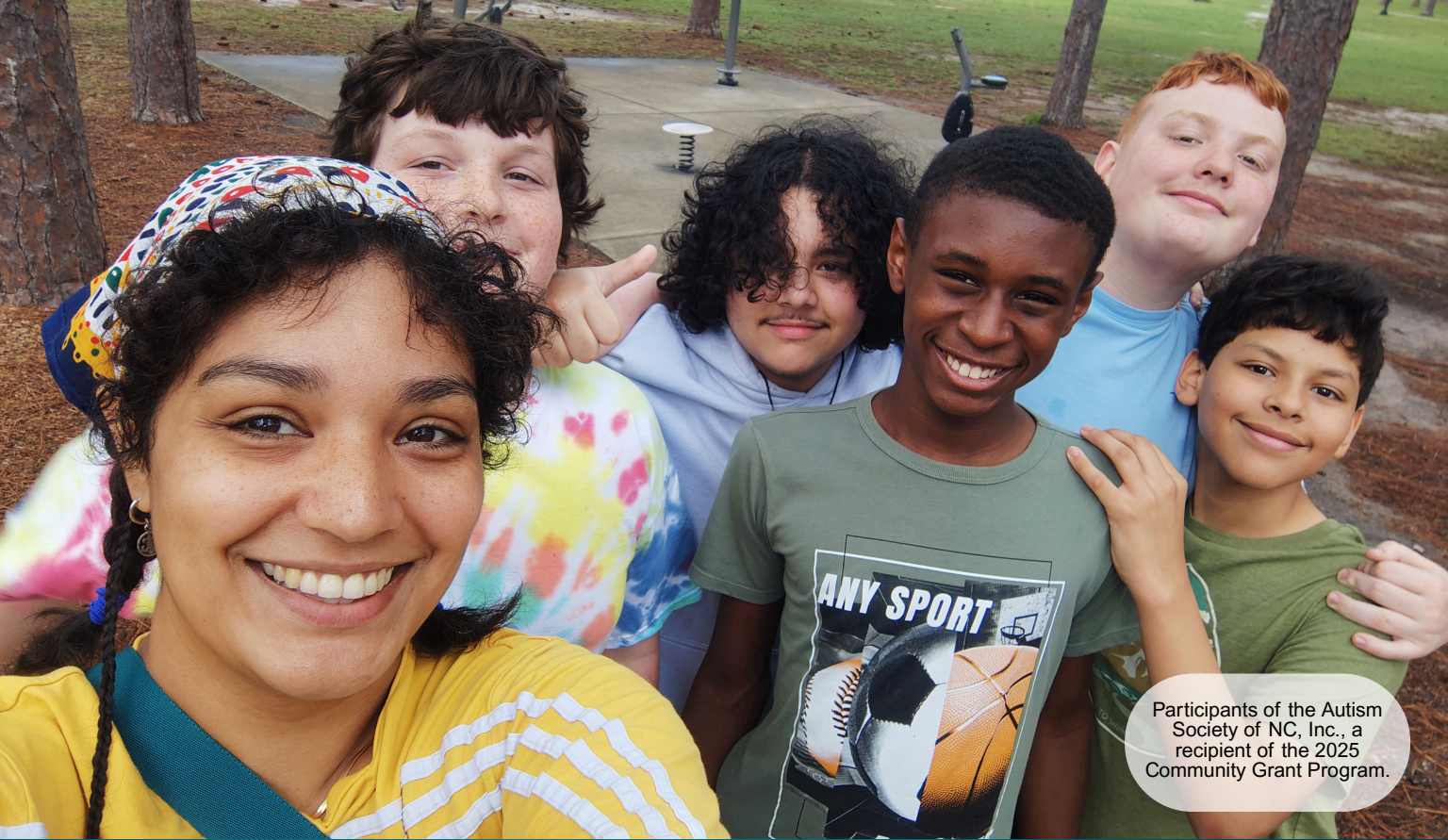
Participants of the Autism Society of NC, Inc., a recipient of the 2025 Community Grant Program.