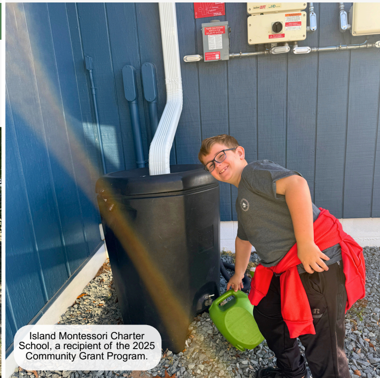
Island Montessori Charter School, a recipient of the 2025 Community Grant Program.