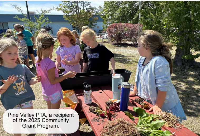
Pine Valley PTA, a recipient of the 2025 Community Grant Program.

To support the expansion of innovative STEM programs in both after and in school settings.