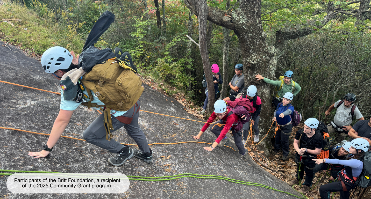
Participants of the Britt Foundation, a recipient of the 2025 Community Grant program.