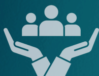
Social and Health Equity

The Endowment's mission is to improve the health, education, safety, and economic opportunity of every person in New Hanover County.