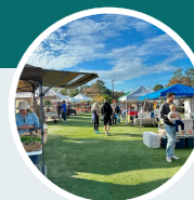
Wilmington Farmer's Market